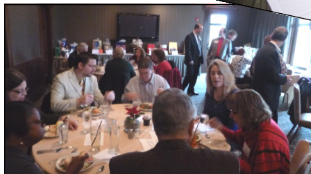
Aging in Place , April 23, 2014