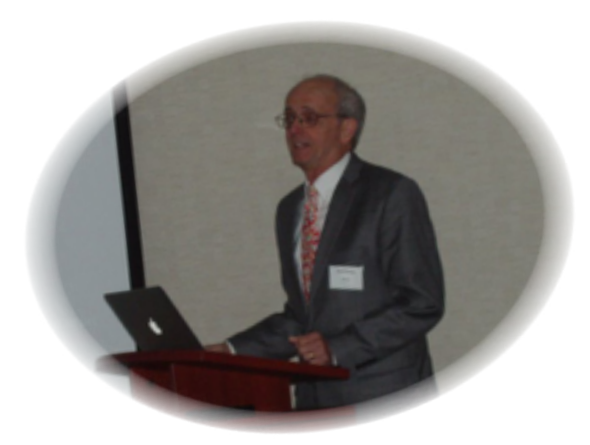
April Regional Meeting: "The Challenges of Housing ALICE and Impacts of Affordable Housing in New Jersey"